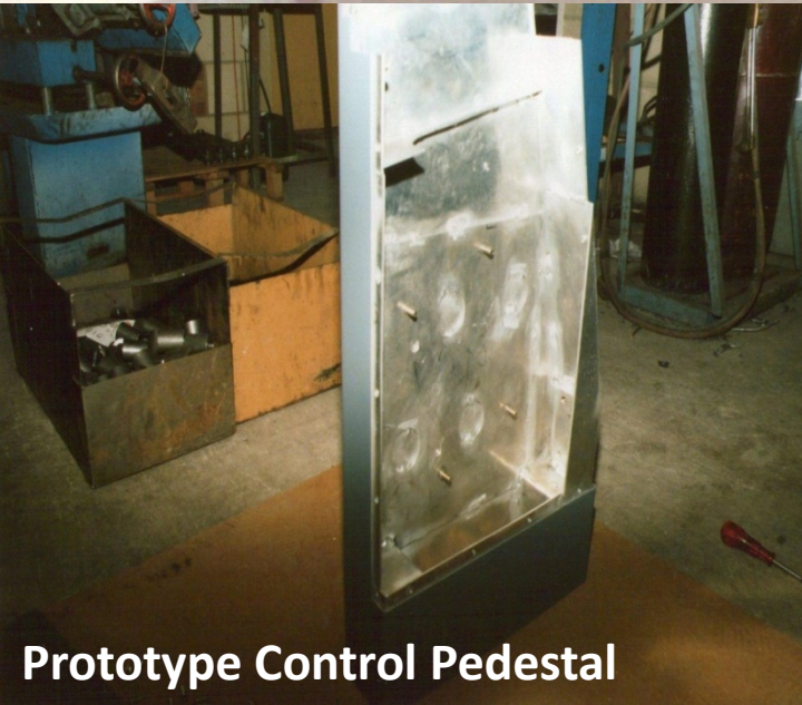
Prototype Control Pedestal

With a proven history of manufacturing sheet metal fabrications, in mild steel, stainless steel & aluminium, from light sheet metal fabrications to heavier plate work. Our clients can be confident of receiving a reliable & quality service, ranging from a one off bespoke fabrication to large volume production runs, of components, enclosures, tanks etc for many Industries including Water & Sewage, Highways, Electronics, Automotive, Mail to name but a few.