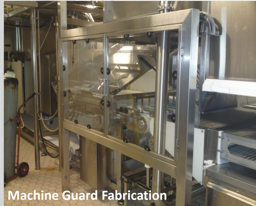
Machine Guard Fabrication