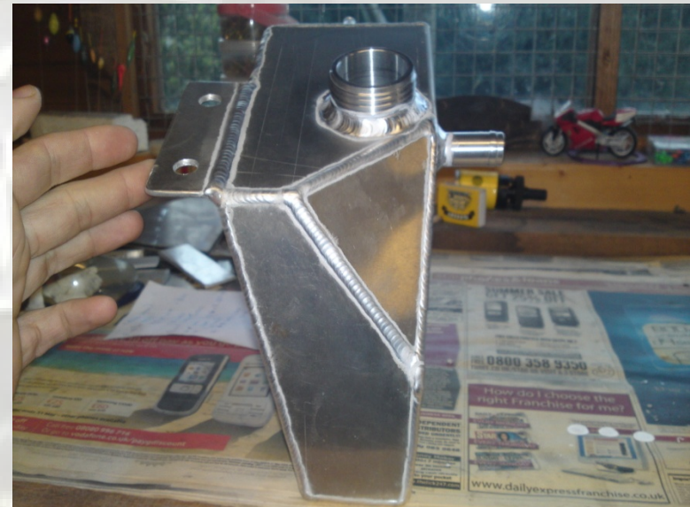
Aluminium Oil Tank

One of the most enjoyable materials to work with, we welcome any fabricational challenge with aluminium and ensure our clients receive a quality product, ranging from a one off bespoke design & build fabrication to production run fabrications for the Leisure, Education, Coach Building, Automotive & Environmental Industries.