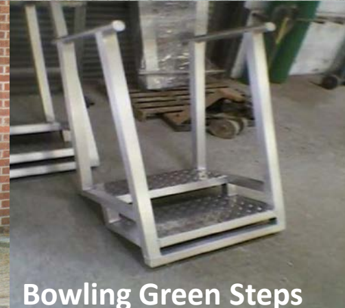
Bowling Green Steps