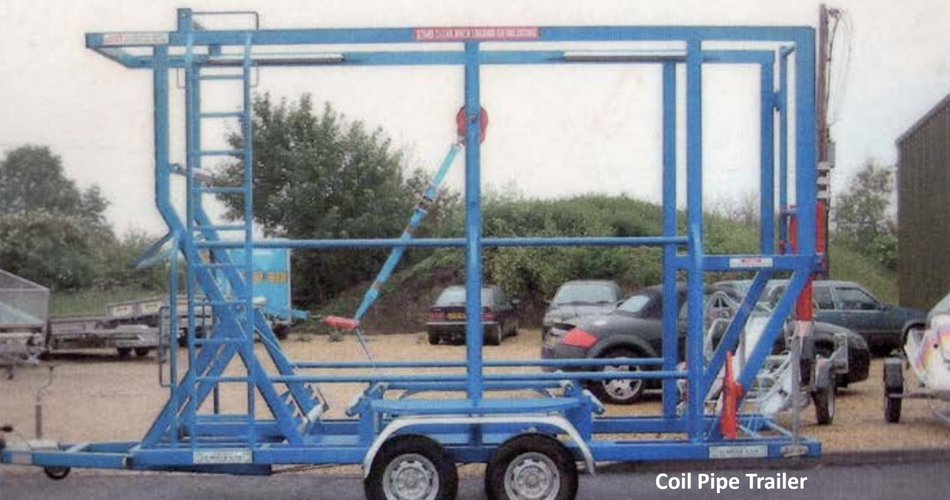
Coil Pipe Trailer

From the early years of offering only skilled subcontract labour to local engineering Companies, we have formed a close relationship with many engineering & manufacturing Companies, over a wide section of industries & over a wide arrear, to offer our own welding & fabrication services both in-house and on site. Our energy & determination, along with our trust & reliability comes second to none.