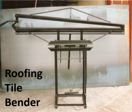
Roofing Tile Bender