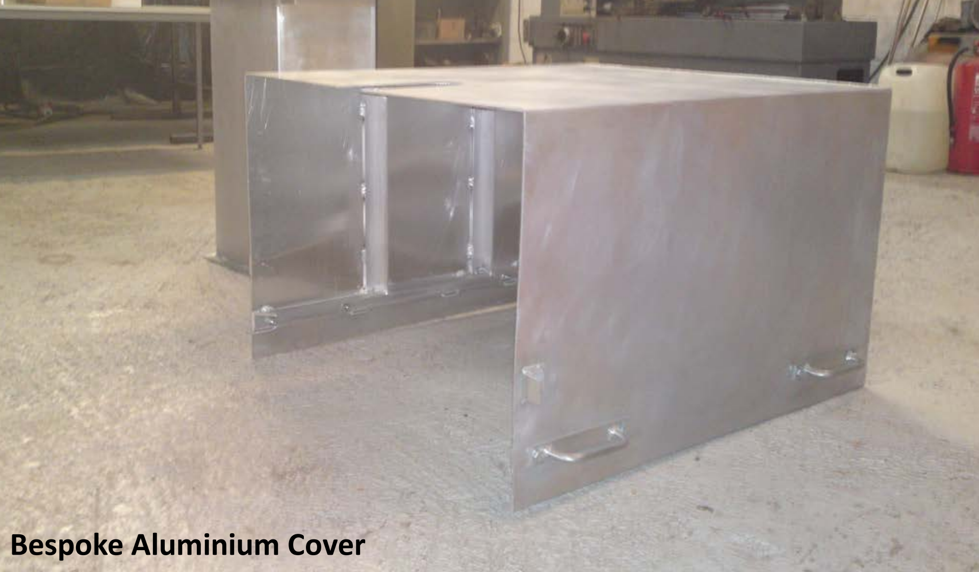
Bespoke Aluminium Cover

Acting as partners to our customers rather than simply a supplier, we are committed to forming long-term customer relationships based on trust and reliability.