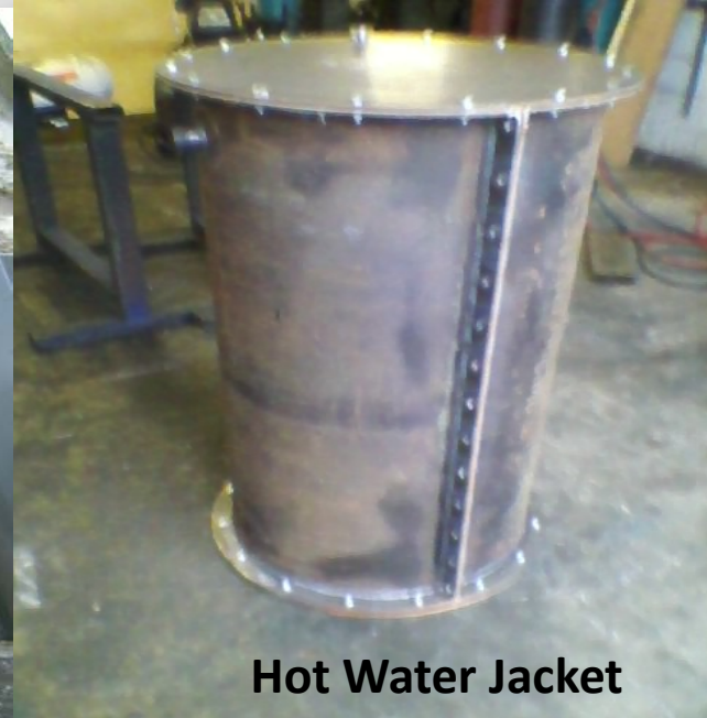
Hot Water Jacket