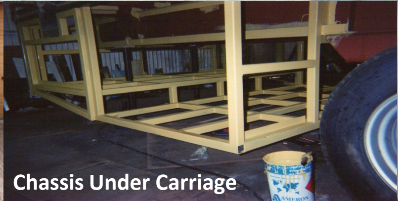
Chassis Under Carriage