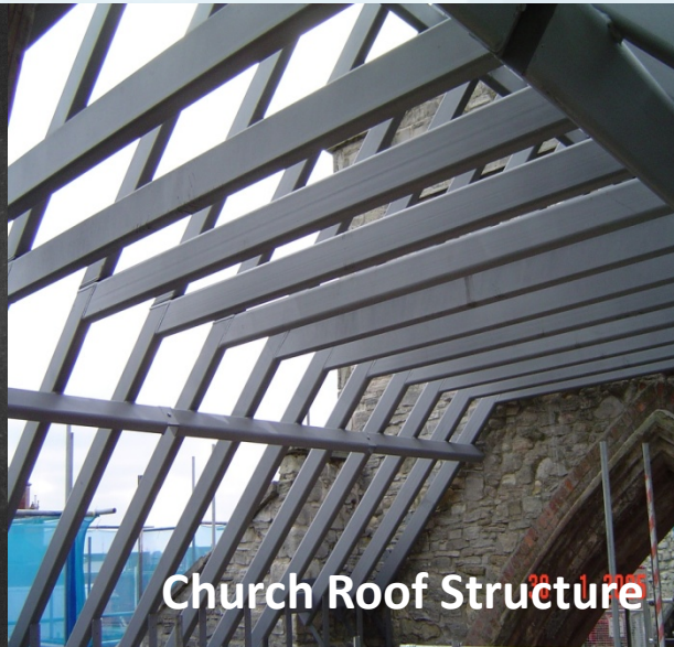
Church Roof Structure